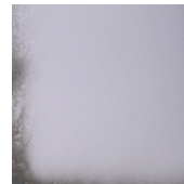
AMG1 - Light Antique Mirror Glass