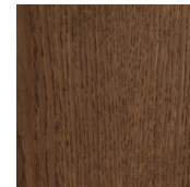
02 - Medium Oak